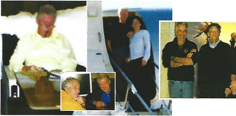
▲ It is alleged that Jeffrey Epstein, convicted of sexual abuse and arrested for sex trafficking (he subsequently was 'suicided'), ran a blackmail operation. The above shots show Epstein with former US president Bill Clinton and oligarch Bill Gates.

at award shows and in every video and signs and symbols...” exclaimed Gibson. He went on to add that Hollywood is overflowing with “satanic paedophiles.” 9